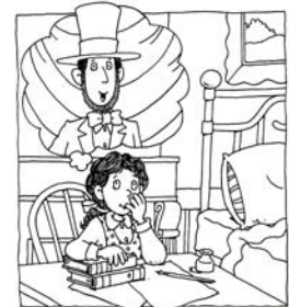
An Original Readers' Theater Play From Weekly Reader