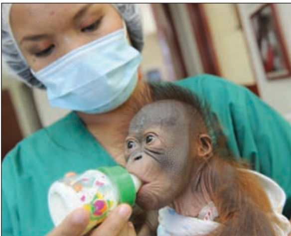
A nurse at the hospital feeds a baby orangutan.

"The ultimate plan [is to] return [the] apes to the wild," says a hospital veterinarian. "It's a matter of the survival of the species."