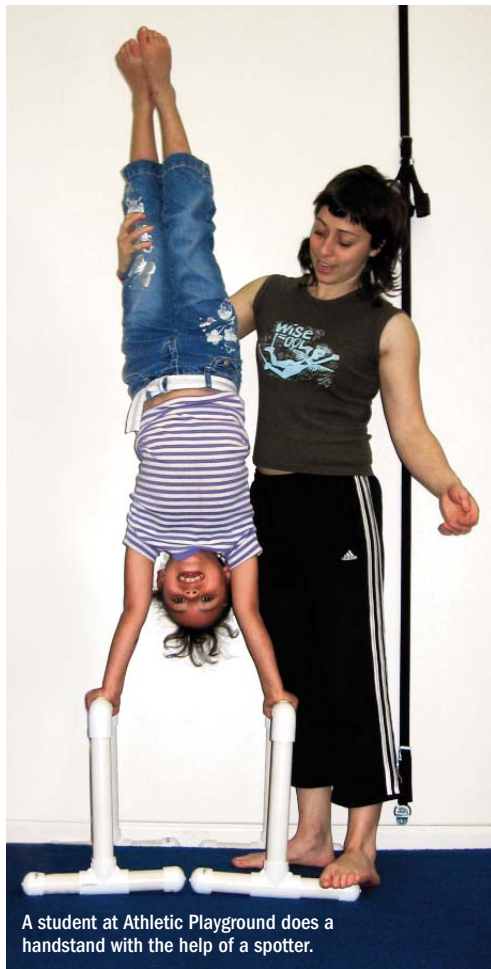
A student at Athletic Playground does a handstand with the help of a spotter.

One way to have fun while getting fit is to look at exercise in a new way. How about upside down?